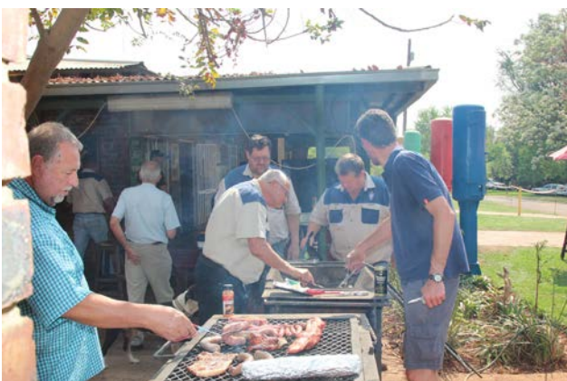
So tussen die rookwalms deur word radio gepraat..