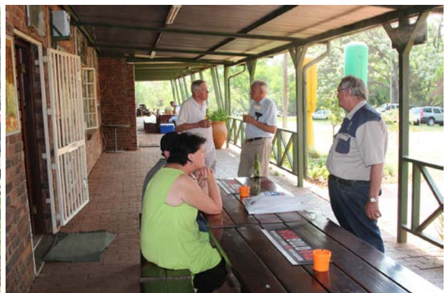
Nabetragting en lekker gesels na die vergadering